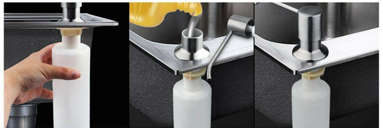
4.Tighten the bottle