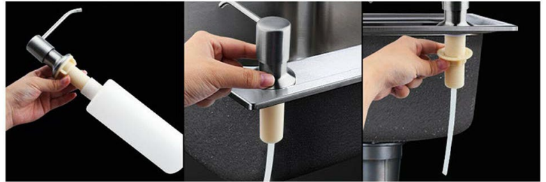
1.Split soap bottle